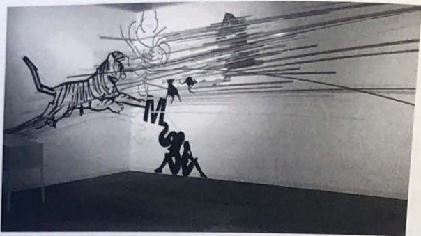
Nic Hess, Untitled , 2001

The globes, flags, and logos seem to announce an engagement with the processes of globalisation, as if those processes were easily circumscribed and transparently called forth in the various images. Are they?